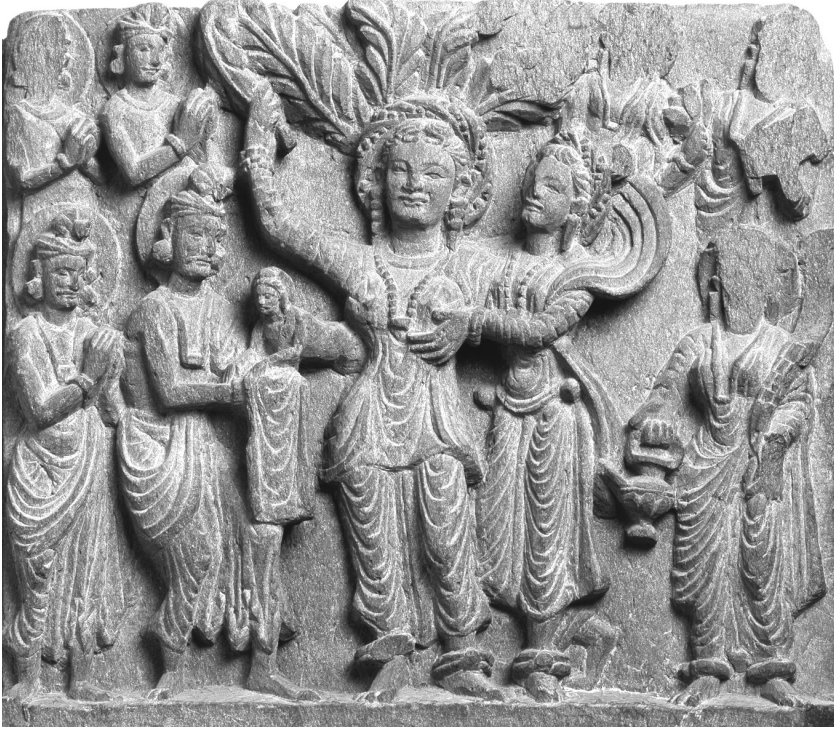
17. Birth of Buddha , 2nd to 3rd century A.D., Ashmolean Museum, Oxford, U.K.

The iconographic key to this relief lies in the small figure emerging from the side of the central woman. If we know the story, or “text,” of the birth of the Indian prince Siddhartha, we recognize the woman as Queen Maya, the mother of the Buddha. Her dress and jewelry are consistent with her royal status. According to the traditional “text” of his birth, Siddhartha emerged from his mother’s side as she stood beneath a Sal tree in the Lumbini Grove. The two male figures at Maya’s right are usually identified as the gods Indra and Brahma, who attended Siddhartha’s birth. The praying figures recognize the holy nature of the newborn prince. They also have halos (the circles around their heads), which identify them as potential bodhisattvas—enlightened beings who have renounced the goal of Nirvana to help others attain it. As a young man, Siddhartha attains enlightenment while meditating under the pipal tree and becomes the Buddha.