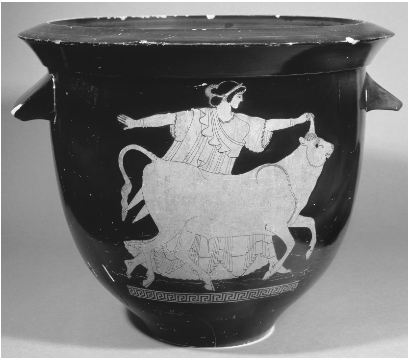
22. Berlin Painter, Europa and the Bull , c. 490 B.C., Museo Archeologico, Tarquinia, Italy.

Zeus saw Europa the daughter of Phoenix [the Phoenician] gathering flowers in a meadow with some nymphs and fell in love