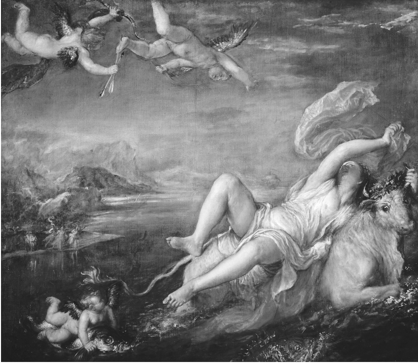
23. Titian, The Rape of Europa , 1559–1562, Isabella Stewart Gardner Museum, Boston, Mass.

In its role as “text,” Titian’s Europa was reinforced by Ovid’s account of the weaving contest between Minerva and Arachne. Ovid’s text reads as follows: