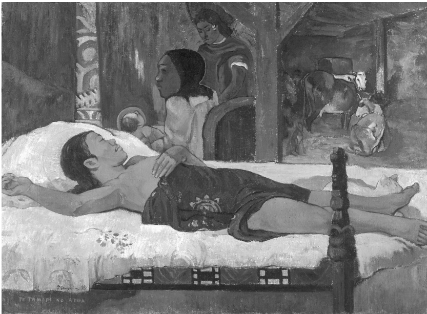
20. Paul Gauguin, Te tamari no atua ( The Child of God ), 1895–1896, Bayerische Staatsgemäldesammlungen, Neue Pinakothek, Munich, Germany.

The late-nineteenth-century painting entitled Te tamari no atua ( The Child of God ) [20], by Paul Gauguin, shows a brown-skinned woman with her eyes closed, lying on a bed. She wears a blue cloth around her lower torso, and a cat sleeps at her feet. Seated at the far side of the bed is a woman in lavender holding a baby. Immediately to her right stands a figure with green wings. In the