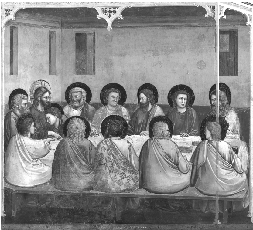
19. Giotto, Last Supper , c. 1305, Arena Chapel, Padua, Italy.

The Nativity opens the story of Christ's childhood, the Last Supper that of his Passion. In the thirteenth century, pictures of the Nativity showing the Child in a manger on an altar alluded to Christ's future sacrifice. Both scenes represent the mystery of incarnation: in the first of them that of the Second Person of the Trinity into human flesh, in the second—the transformation of bread and wine into Christ's flesh and blood. Moreover, Giotto tried to emphasize the visual resemblance of both scenes. Despite the Byzantine tradition, Giotto reestablished in his Nativity the shed of Early Christian iconography, with a parallel in the edifice of the Last Supper . Giotto placed Christ in the Last Supper and the Virgin in the Nativity at the left part of the composition and insisted upon their resemblance by emphasizing both the Virgin's and John's tenderness towards Christ. 5