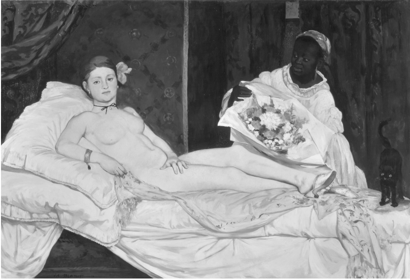
21. Édouard Manet, Olympia , 1863, Musée d'Orsay, Paris, France.

raphy to include his own experience and relates it to the parallel between Tahiti and the Paradise that is refound through Jesus' birth. Furthermore, the struggle between sin and salvation that runs through Christian history was a facet of Gauguin's personal struggle. He represented himself variously as a saint, as Jesus, as a sinner, and as Satan.