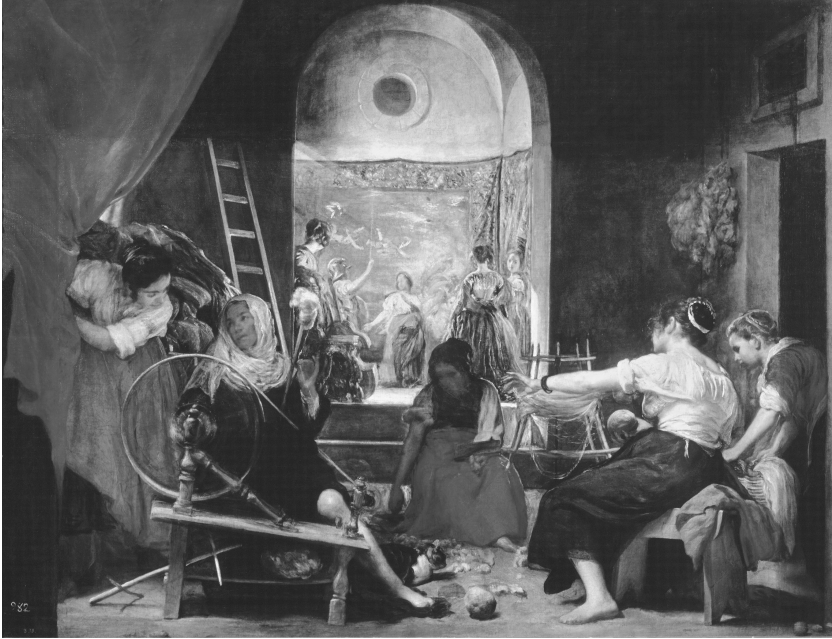
24. Diego Velázquez, The Spinners, or The Fable of Arachne , late 1650s, Prado, Madrid, Spain.

a complex scene that includes contemporary seventeenth-century women spinning in the foreground and the mythological contest on a stage in the background. A copy of Titian's picture forms the backdrop of the stage.