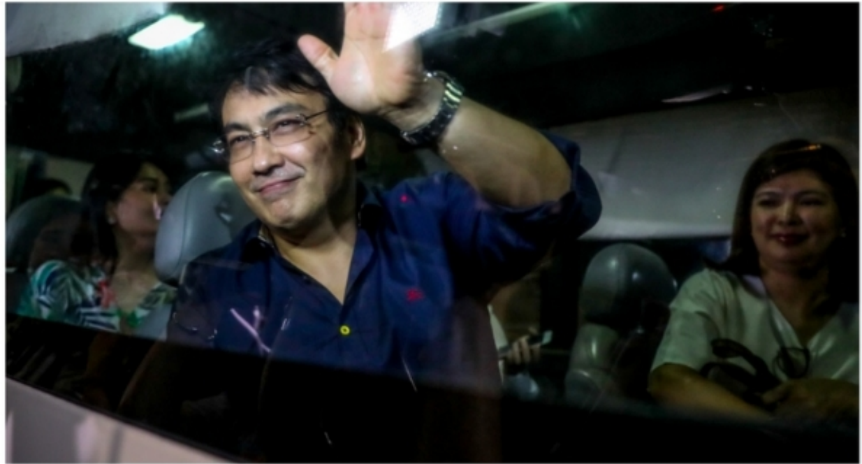
Sen. Bong Revilla in 2018.