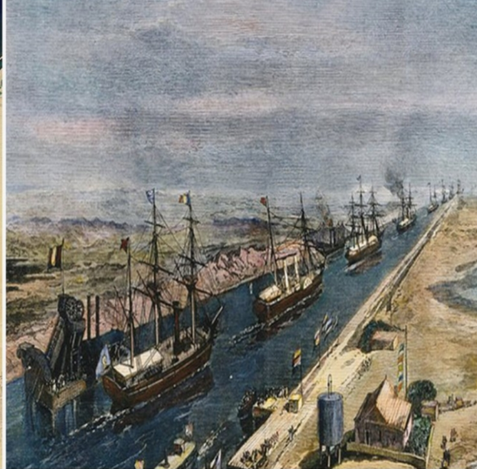
Convoys of ships entering the Suez Canal. November 17, 1869