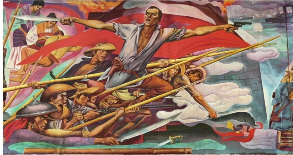
Philippine Revolution (1896-1898)