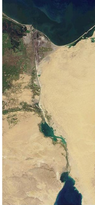
The Suez Canal showing from space