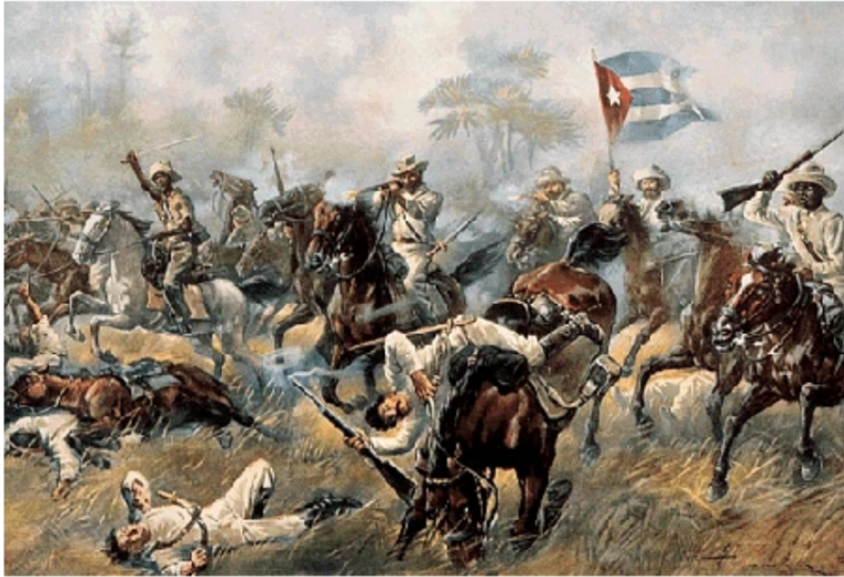
Cuban War of Independence (1895-1898)