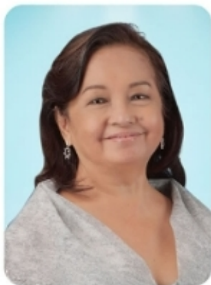
Hon. Macapagal-Arroyo, Gloria

District Representative Pampanga , 2nd District