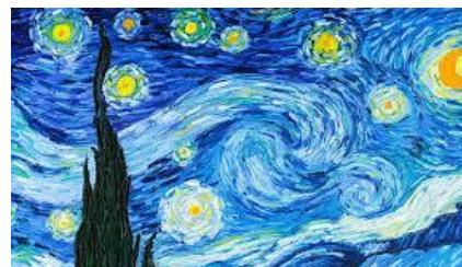
THE STARRY NIGHT