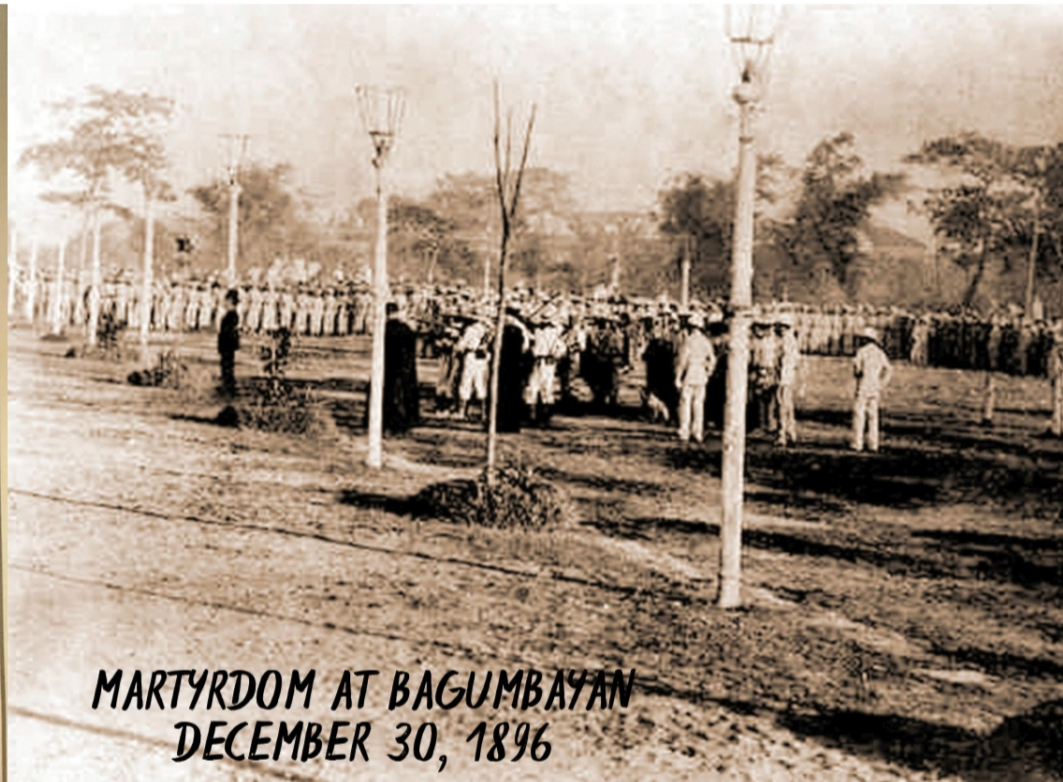
MARTYRDOM AT BAGUMBAYAN DECEMBER 30, 1896

Matapos gumulong ang mga tambol, isinigaw ng namumunong opisyal ang utos ng pagputok. Nang siya ay natumba na sa lupa, nilapitan siya ng isang opisyal upang ibigay ang huling pagputok, ang tiro de gracia . Natapos ang lahat ng ika-7:03 ng umaga.