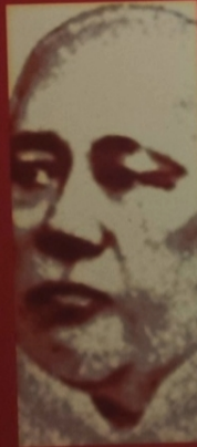
Ambrosio Rianzares Bautista

Some of those who were asked to give testimonies regarding Rizal