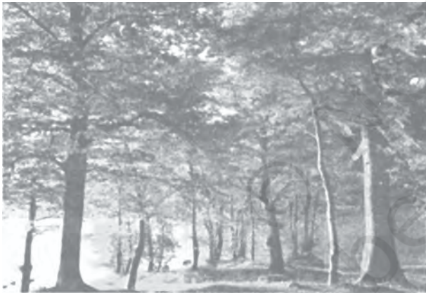
Figure 5.3 : Deciduous Forests

These are the most widespread forests in India. They are also called the monsoon forests. They spread over regions which receive rainfall between 70-200 cm. On the basis of the availability of water, these forests are further divided into moist and dry deciduous.