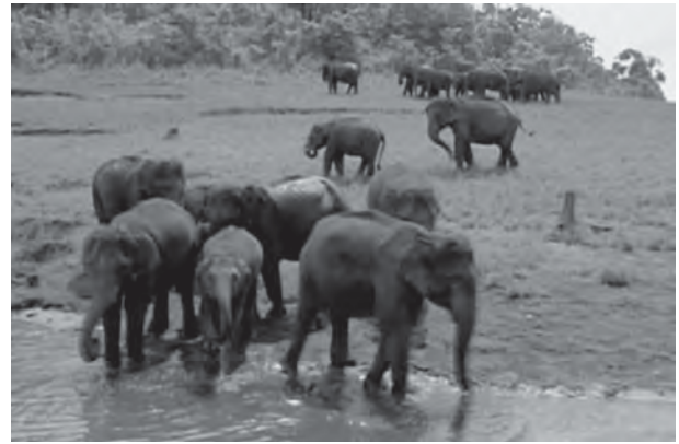
Figure 5.7 : Elephants in their Natural Habitat

For the purpose of effective conservation of flora and fauna, special steps have been initiated by the Government of India in