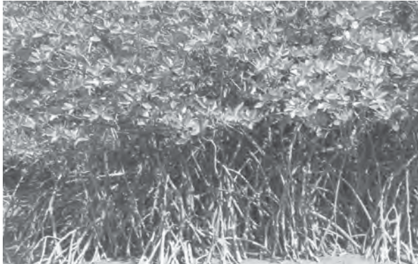
Figure 5.6 : Mangrove Forests

They consist of a number of salt-tolerant species of plants. Crisscrossed by creeks of stagnant water and tidal flows, these forests give shelter to a wide variety of birds.