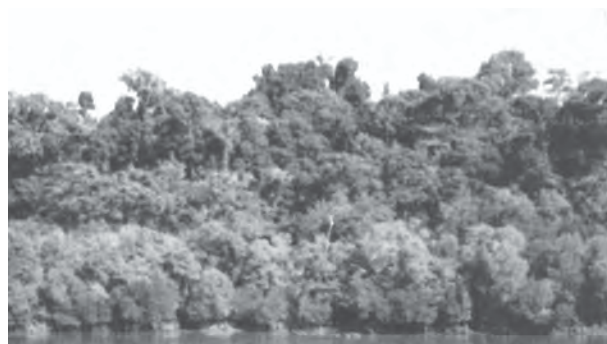
Figure 5.1 : Evergreen Forest

The semi evergreen forests are found in the less rainy parts of these regions. Such forests have a mixture of evergreen and moist deciduous trees. The undergrowing climbers provide an evergreen character to these forests. Main species are white cedar, hollock and kail.