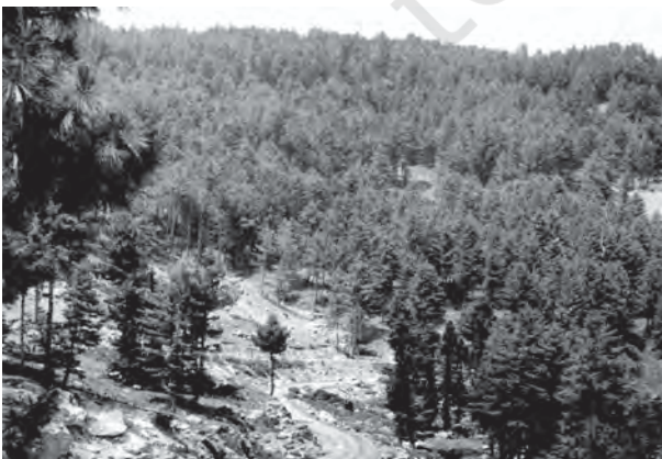
Figure 5.5 : Montane Forests

The Himalayan ranges show a succession of vegetation from the tropical to the tundra, which change in with the altitude. Deciduous forests are found in the foothills of the Himalayas. It is succeeded by the wet temperate type of forests between an altitude of 1,000-2,000 m. In the higher hill ranges of northeastern India, hilly areas of West Bengal and Uttaranchal, evergreen broad leaf trees such as oak and chestnut are predominant. Between 1,500-1,750 m, pine forests are also well-developed in this zone, with Chir Pine as a very useful commercial tree. Deodar, a highly valued endemic species grows mainly in the western part of the Himalayan range. Deodar is a durable wood mainly used in construction activity. Similarly, the chinar and the walnut, which sustain the famous Kashmir handicrafts, belong to this zone. Blue pine and spruce appear at altitudes of 2,225-3,048 m. At many places in this zone, temperate grasslands are also found. But in the higher reaches there is a transition to Alpine forests and pastures. Silver firs, junipers, pines, birch and rhododendrons, etc. occur between 3,000-4,000 m. However, these pastures are used extensively for transhumance by tribes like the Gujjars, the Bakarwals, the Bhotiyas and the Gaddis. The southern slopes of the Himalayas carry a thicker vegetation cover because of relatively higher precipitation than the drier north-facing slopes. At higher altitudes, mosses and lichens form part of the tundra vegetation.