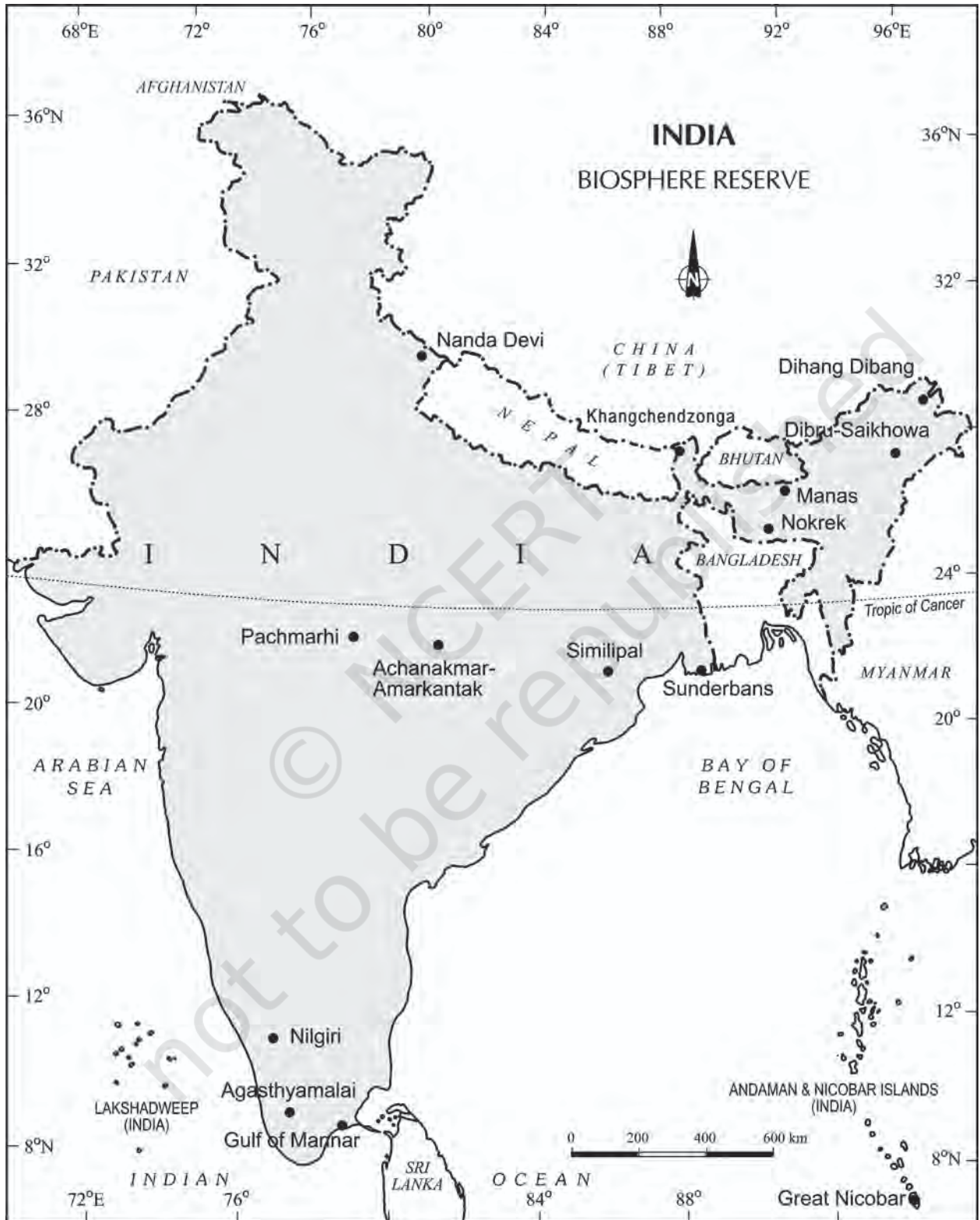
Figure 5.8 : India : Biosphere Reserves