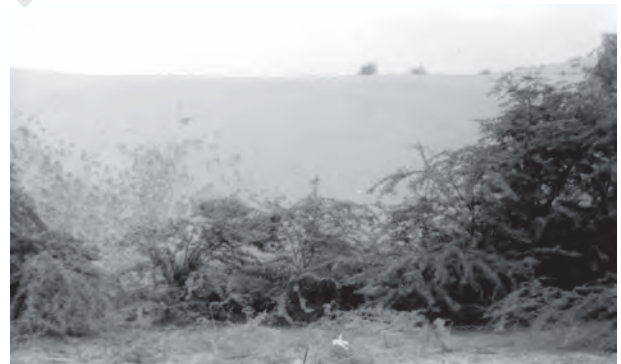
Figure 5.4 : Tropical Thorn Forests

Tropical thorn forests occur in the areas which receive rainfall less than 50 cm. These consist of a variety of grasses and shrubs. It includes semi-arid areas of south west Punjab, Haryana, Rajasthan, Gujarat, Madhya Pradesh and Uttar Pradesh. In these forests, plants remain leafless for most part of the year and give an expression of scrub vegetation. Important species found are babool , ber , and wild date palm, khair , neem , khejri , palas , etc. Tussocky grass grows upto a height of 2 m as the under growth.