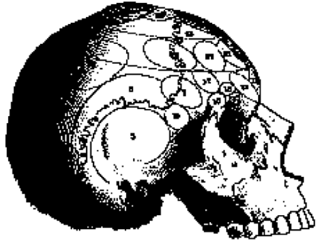
FIG. 4. Illustration of Gall's phrenological system, from Robley Dunglison's textbook Human Physiology . 46 Spurzheim's revised phrenological map was also included in the textbook.

During the early 1830s, phrenology set fire to the highest intellectual circles of America, 103-106 particularly in Philadelphia and Boston. Although all varieties of American intelligentsia were intrigued, it was the physicians who were hardest bit by the phrenology bug, and they constituted a large fraction of the officers and membership