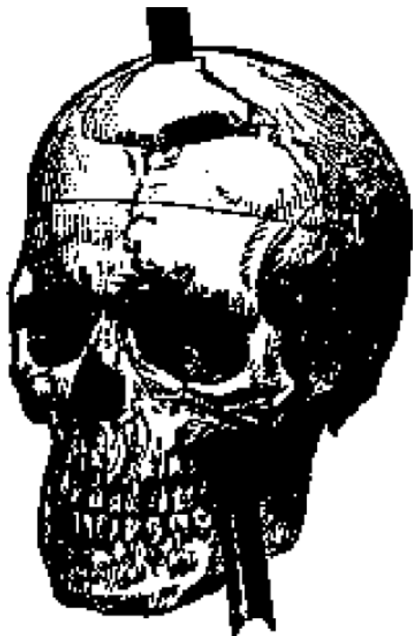
FIG. 1. Woodcut depicting Phineas Gage's skull, with tamping iron shown in mid-flight. From Harlow. 65 The blocks from this illustration were sent by Harvard physiologist H. P. Bowditch to David Ferrier for use in his Goulstonian Lectures on cerebral localization. 49

tion from Jefferson Medical College (JMC) in Philadelphia. Gage's open brain wound was almost certainly the first that had come his way. Harlow's treatment plan would be expected to rest entirely on his medical school training.